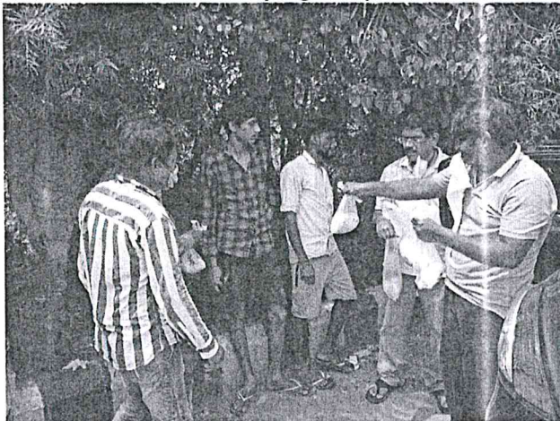
Distribution of Lemon Rice by Exam Cell In-charge