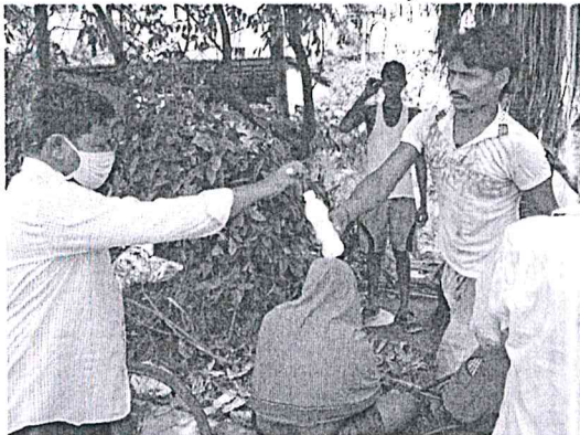
Distribution of Butter Milk by NSS PO