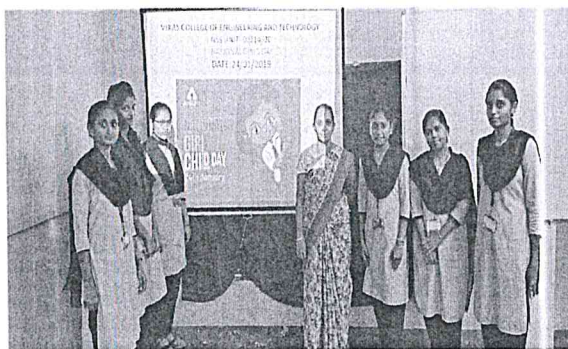
Photo on National Girls Day