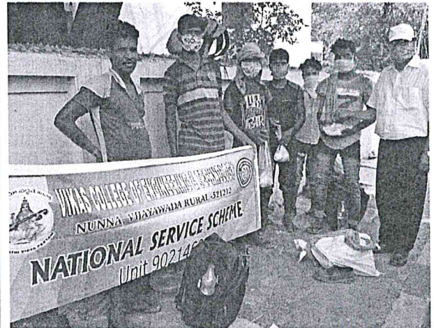
Distribution to the Needy People by Our Staff