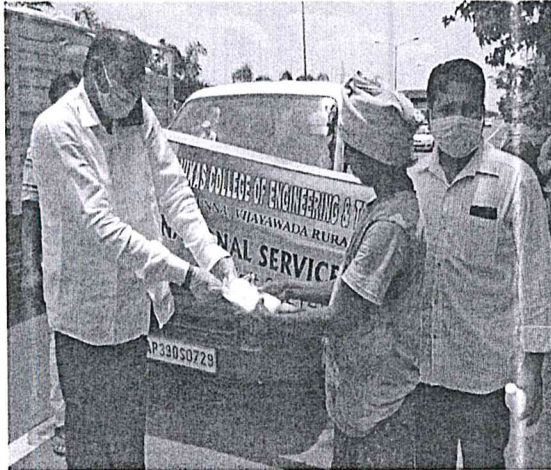
Distribution of Food Packets by Vice-Chairman