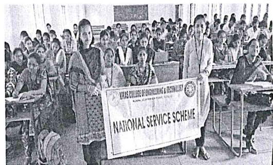
Group photo on National Girls Day