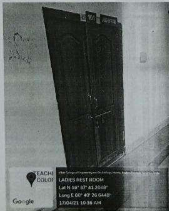
Ladies Rest rooms