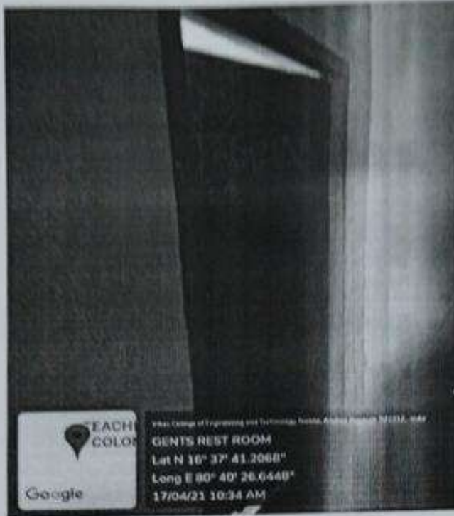
Gents Rest Rooms